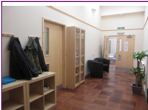
Entrance to Resource Centre

The Bowersdale Resource Centre is a resource and drop in centre for people with mental health problems and learning disabilities living in the Sefton area.