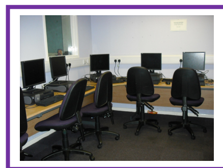
A computer room

We work together with the community on projects and link in with activities. We will support you to be really included and involved.