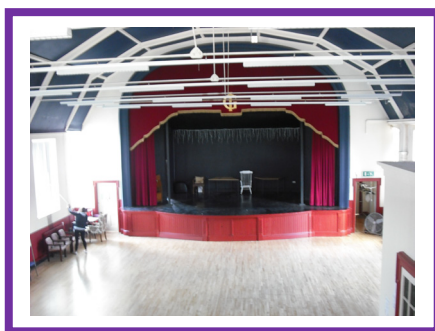
A dance and drama theatre