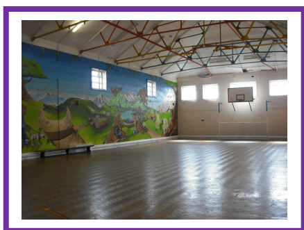
A sports hall